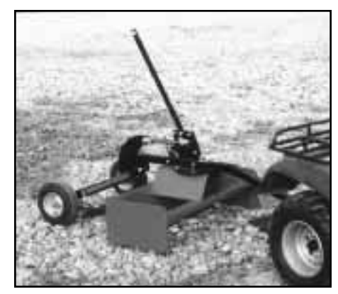
42" Box Scraper Shown